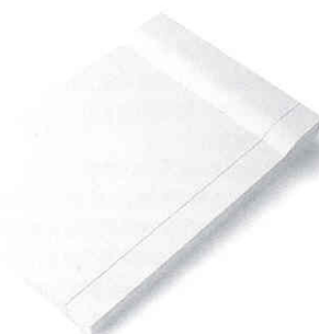
Transparent Media Adapter has the capability of scanning and producing a true negative-to-positive film conversion.

Apple Computer, Inc. 1 Infinite Loop Cupertino, CA 95014 (408) 996-1010 http://www.apple.com/